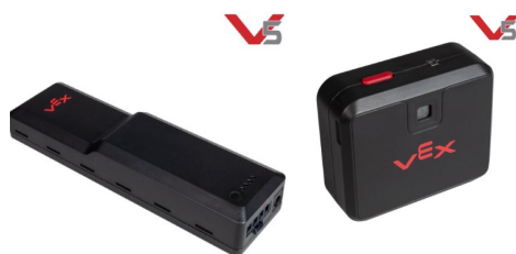
Silver Membership; 6x sponsors