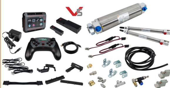
Gold Membership; 6x sponsors