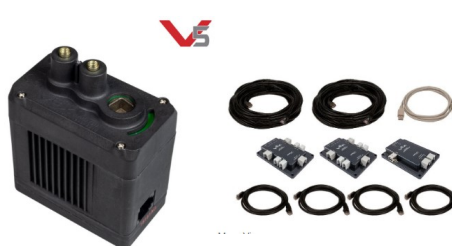
Bronze Membership; 12 sponsors